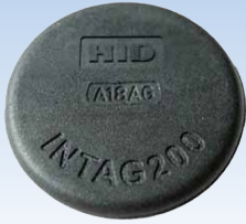
HID IN Tag transponders are proven effective for tagging ballistic vests and protective garments.