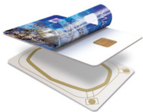
High Definition cards deliver superb image quality on smart cards. HDP Film conforms to the uneven surface created by embedded electronics.

This re-transfer technology seals the card image under the HDP Film, and provides three essential benefits for financial cards: First is over-the-edge printing, which replicates the look of pre-printed cards. Durability is second, with HDP Film protecting the printed image from rubbing off the card. And third is fraud