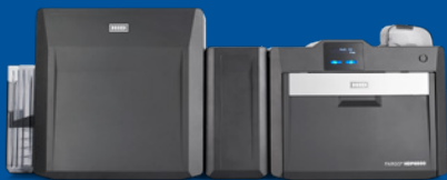
Dual-sided printer/encoder with optional lamination