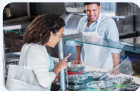
Food Service Carts