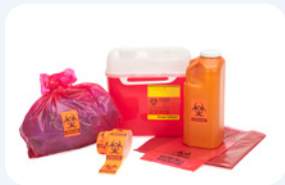
Hazardous Waste Carts