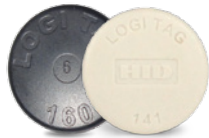
Logi Tag® 160/161